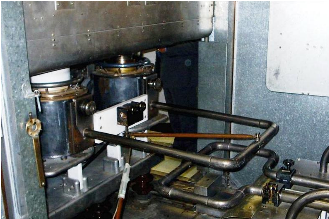
Figure 2 - The PA Compartment (25m Band)

I used to work at the BBC transmitter site at Woofferton, on the Herefordshire and Shropshire border and there the transmitters (called 'senders' in BBC parlance) put out a formidable 250 kW on the shortwave broadcast bands. The P.A. stage of the 250 kW Marconi BD272 'senders' that were installed at Woofferton in 1963 but are still going strong.