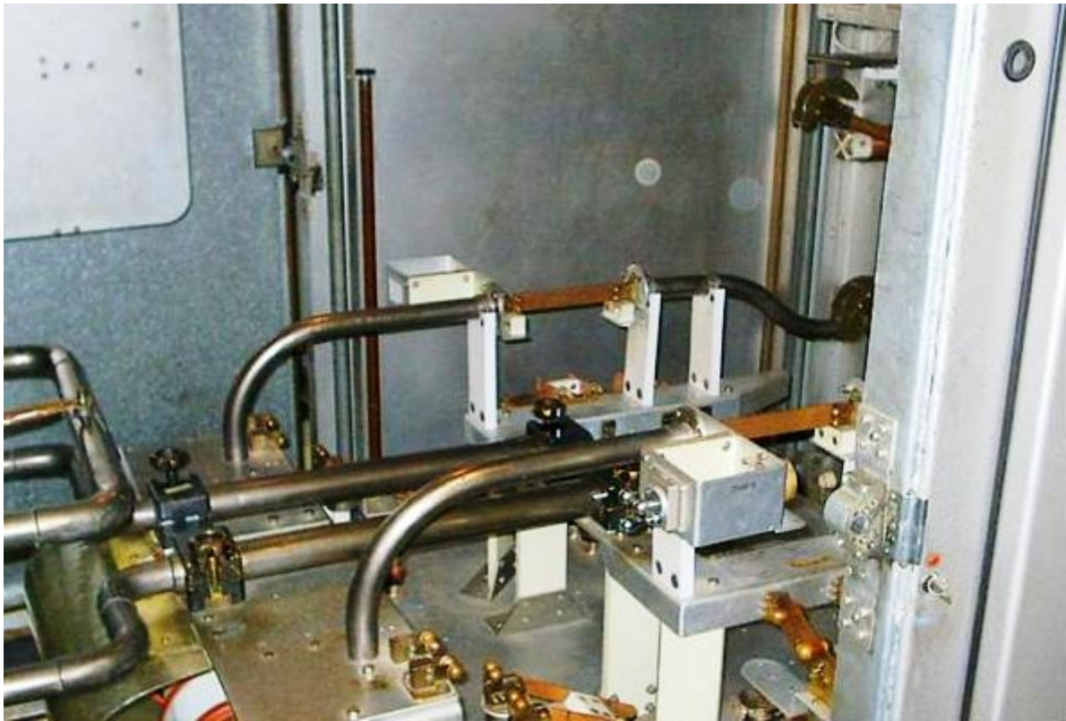
Figure 3 - The PA compartment