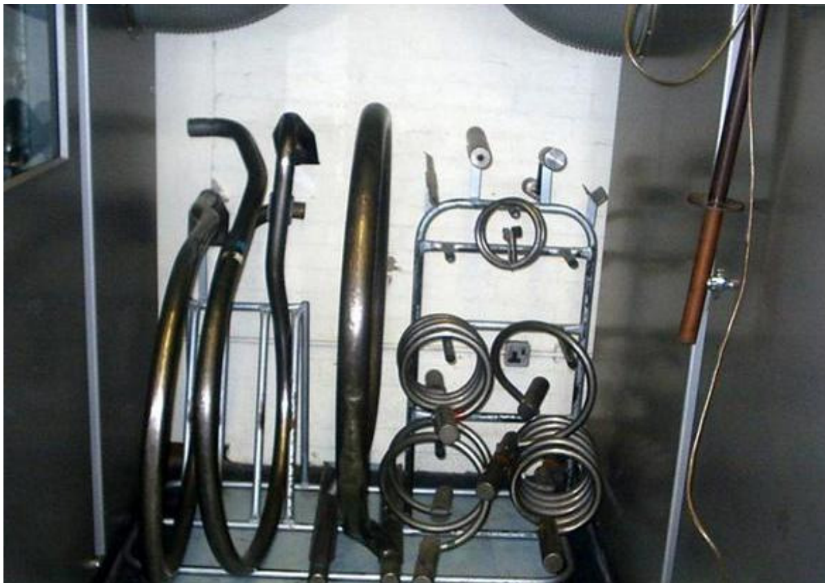
Figure 4 - Plug-In coils for the other bands